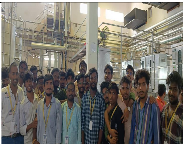
Students Group Photo